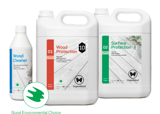
The complete Wood Protection System consists of Wood Cleaner (pre-wash and maintenance wash), 01 Wood Protection (base coat) and 02 Surface Protection (top coat). 01 Wood Protection and Wood Cleaner are eco-labelled with the Swedish Society for Nature Conservation's "Good Environmental Choice".

Maintenance washing with OrganoWood® Wood Cleaner is recommended. If the surface is mechanically worn, for example where people often walk or move furniture, or if the surface is washed with a strong wood cleaner or highpressure washing (should be avoided), the wood fibres in the surface layer may be worn away and thus also the treatment. If this happens, re-treat the worn areas with 01 Wood Protection and complete the treatment with 02 Surface Protection.